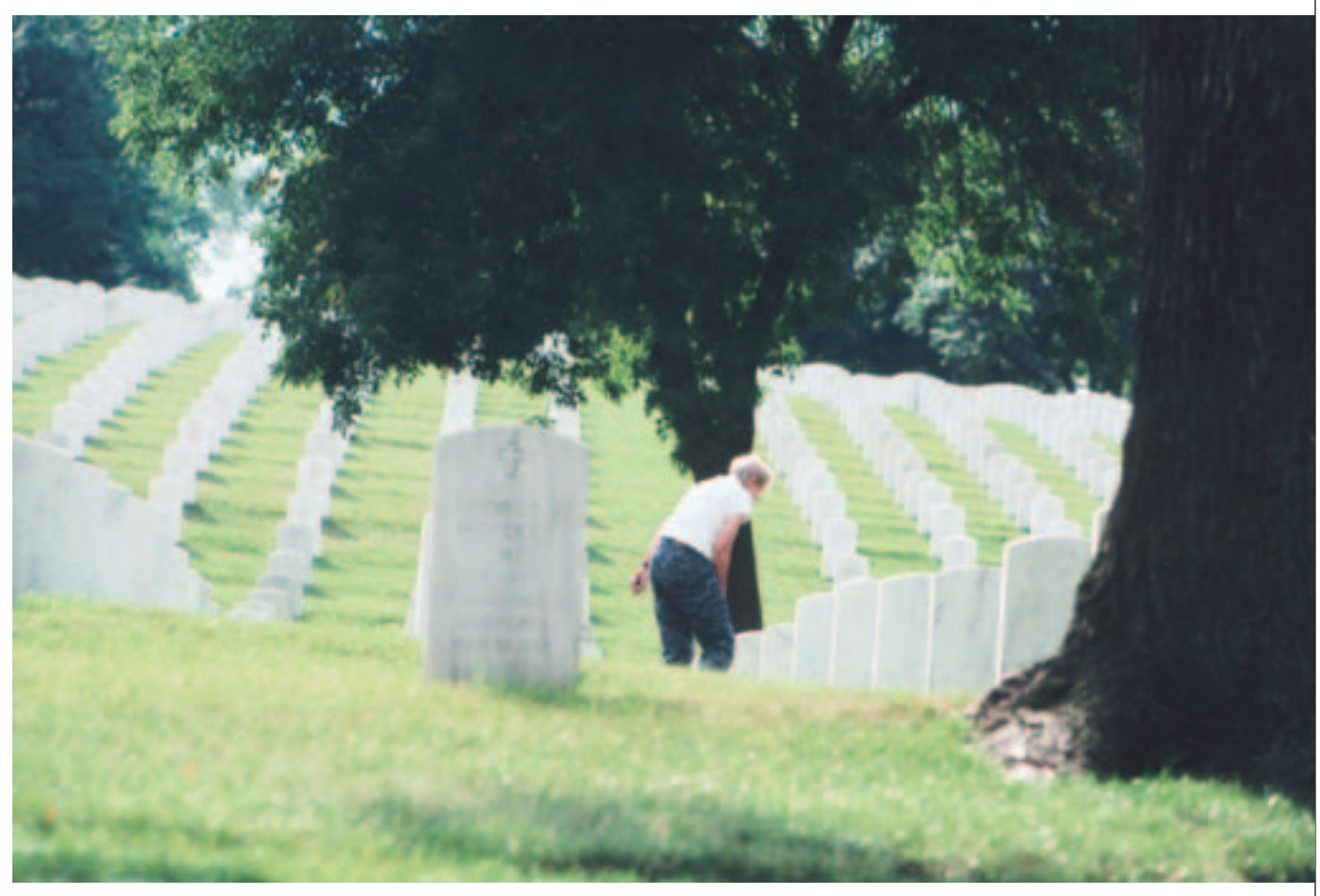
People still visit graves of loved ones buried there.

July, cannons thundered and a grand display of fireworks ended the day.