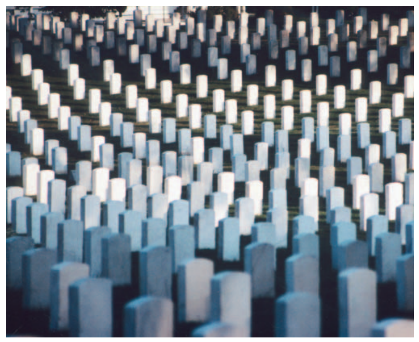
A partly cloudy day provides contrasts of shading to otherwise pure white headstones in the national military cemetery at the Soldiers Home. Some 37,000 veterans and spouses are buried here. Starting with a veteran of the War of 1812, they represent all American wars since. The cemetery still is active and open to veterans.

denominational chapel, a firehouse, fine homes for the director and staff, a headquarters, and many auxiliary buildings.