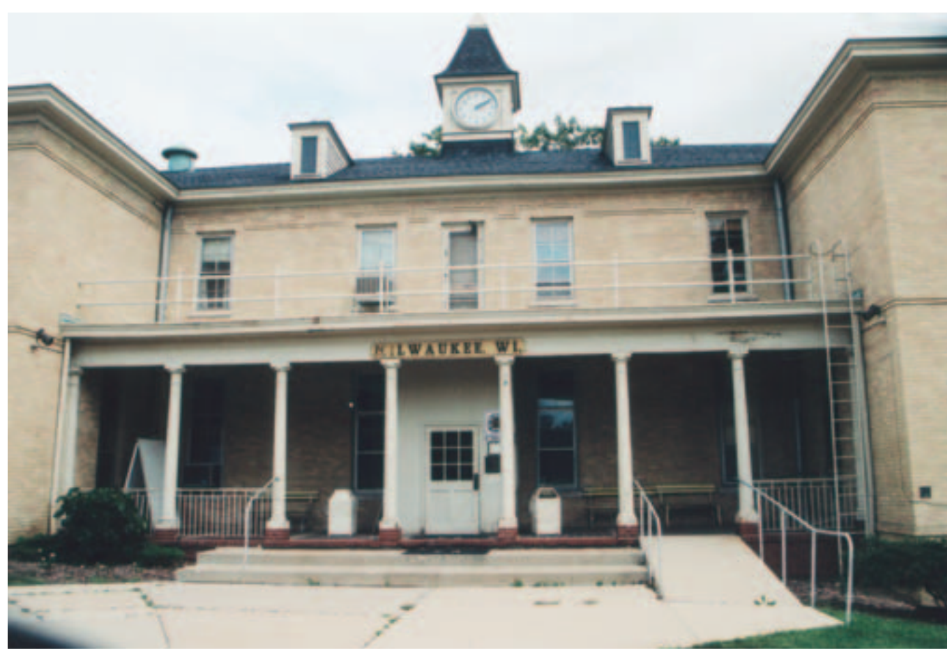
Building 1, Headquarters (1896), was the main office of the VA center until 1942. It currently houses offices for local American Legion and Veterans of Foreign Wars (VFW) posts; the Veterans poppy shop; Sons of Union Veterans of the Civil War; and the Soldiers Home Foundation, which is trying to preserve the campus and its buildings.

treasurer, says the foundation is concentrating on six buildings: The towered main domiciliary (1869), the chapel (1889), Ward Memorial Theater (1881), Headquarters (1896), Wadsworth Library (1891), and the old hospital and convalescent wards (1879).