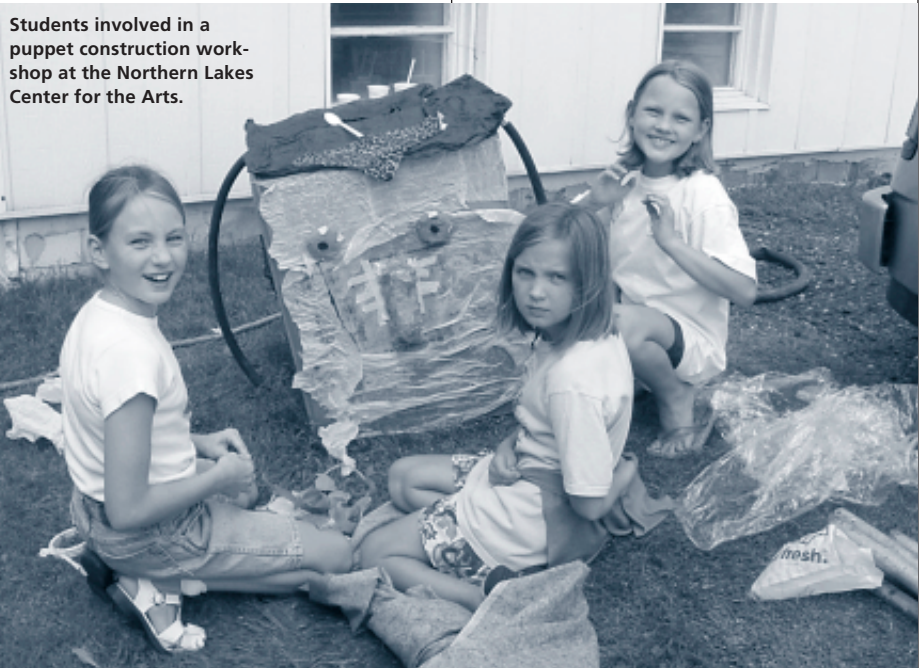
Students involved in a puppet construction workshop at the Northern Lakes Center for the Arts.