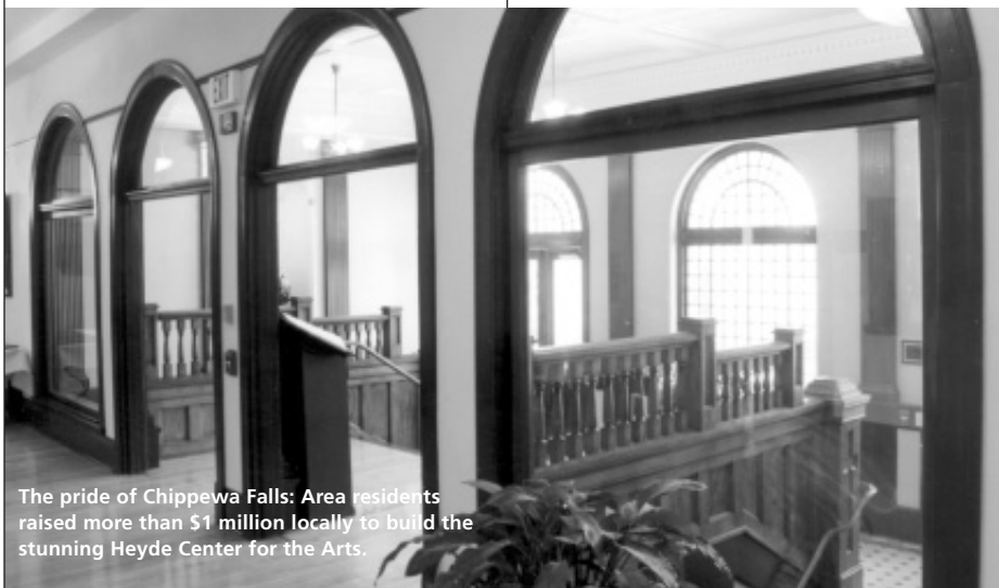
The pride of Chippewa Falls: Area residents raised more than $1 million locally to build the stunning Heyde Center for the Arts.

The Fall Art Tour in southwestern Wisconsin and the Dunn County Artists Tour in northwestern Wisconsin are two