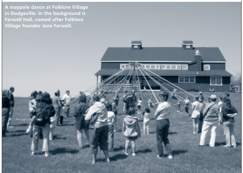
A maypole dance at Folklore Village in Dodgeville. In the background is Farwell Hall, named after Folklore Village founder Jane Farwell.